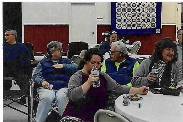
Believe me...it was this high!