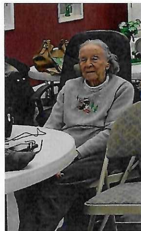
Is it 6:30 yet?